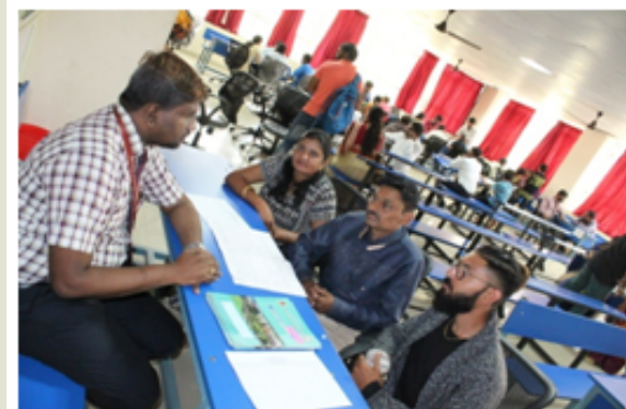
HOD addressing to Parents and Faculty issuing the certificate to student