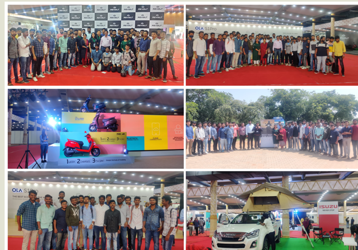
EV-Expo @ Palace Ground Along with HOD Faculties and Students

An education Expo was conducted for the Final year students on 27th May 2022 at Palace ground Bengaluru. Students were addressed on various Technology involved in Electric Vehicle and use of latest features and updates in EV's. Students were also visited to various manufacturing Companies and Stalls.