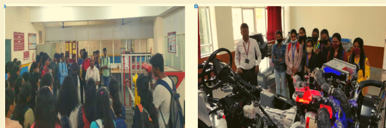
Glimpses of Induction Program Activity

As a part of induction program for first year students campus tour has been organized by the committee.Mechanical department faculties gave an overview on center of excellence labs(Toyota Kirloskar, Rexroth Bosch and FMS system) in the department for the students.