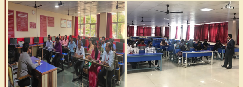
HOD Addressing to Staff & Students

As per the IQAC norms, an orientation session was conducted for all the teaching & non-teaching staff members and also for UG students during the start of the odd semester 2022-23. The HOD addressed the roles & responsibilities, code of conduct and different committees that are present for the welfare of the students. Everyone was strictly informed to abide by the rules & regulations of the department and the college.