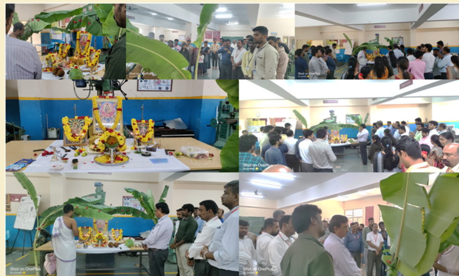
Glimpses of Ayudha Pooja celebrations at the department

Ayudha Pooja was celebrated on 1st October 2022, Pooja was performed by the HOD and staff members of the department on the occasion of Vijayadashami and also the machinery of other labs was also cleaned and decorated. The Pooja was done accordingly.