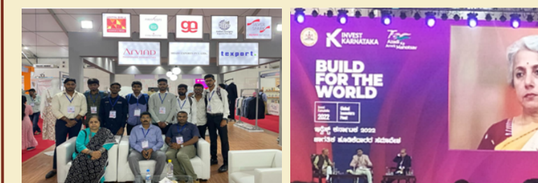
Panel Discussion With Health Minister & Chief Scientist WHO