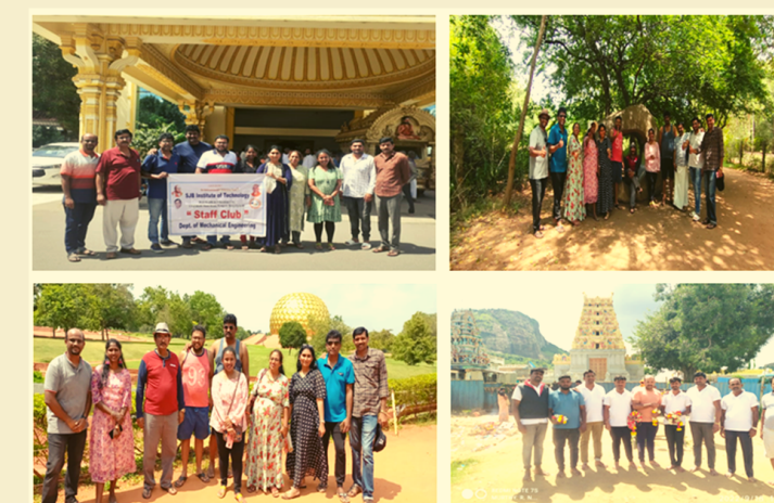
Staff Members at Golden Temple and Pondicherry