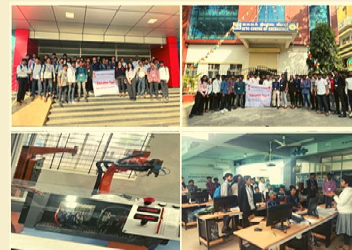
Students at GTTC, Bengaluru

Industrial visit was conducted for the second year students on 01 December 2022 at Government tool Room training Centre Bengaluru. Students were addressed on various topics like CAD / CAM, CNC machines for tooling, Precision Components, Laser for Industries, Rapid prototyping, vacuum casting