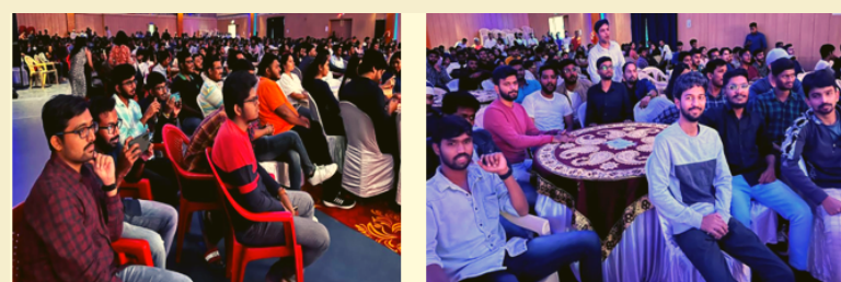
Alumni's @ SJB Auditorium