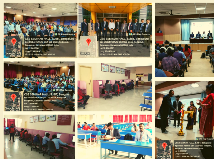
Glimpses of FDP on "Ability Enhancement Courses in Mechanical Engineering"